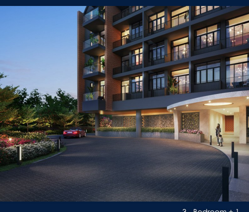
3 - Bedroom + 1