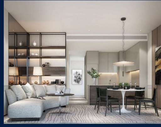
2 - Bedroom + Study