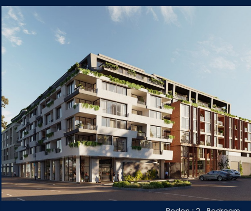
Roden: 2 - Bedroom